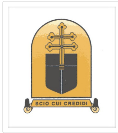
Archbishop Jordan Catholic School