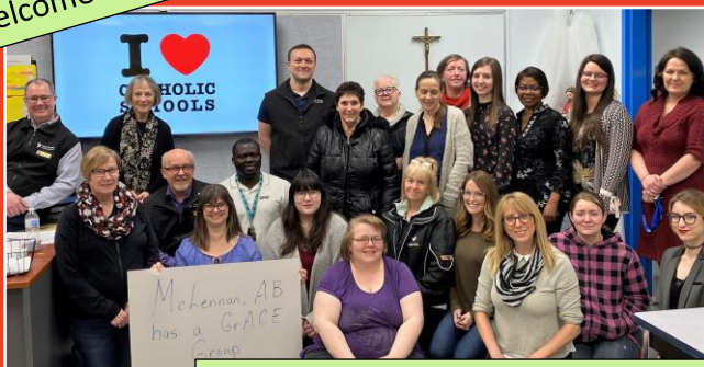
McLennan- Holy Family Catholic Schools

The mission of GrACE is to inspire, invigorate and embolden the spirit of Catholic education in order to unite, engage, educate and communicate with one voice on its behalf.