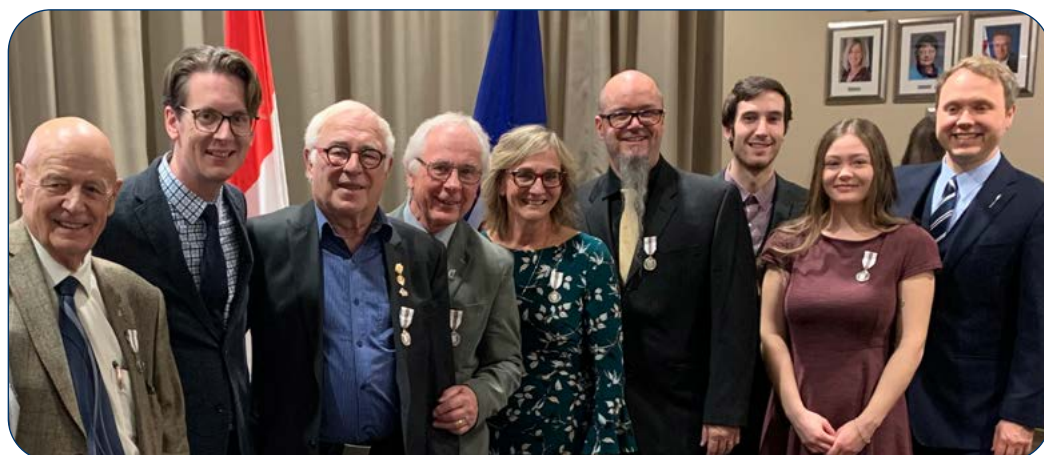
Multiple members of the EICS family — including current Trustees and teachers — were recipients of the Queen's Platinum Jubilee Medal in a December ceremony.