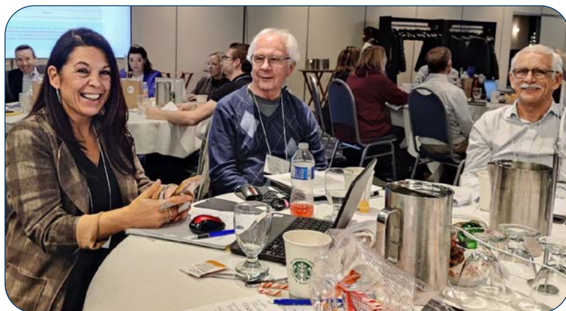
Trustees attend the ASBA general meeting (above), and thank supporters at the REAL Foundation Golf Tournament (below).