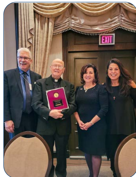
EICS Trustees attend the ACSTA's MLA reception in the spring (top left), as well as the ACSTA's fall annual general meeting (top right).