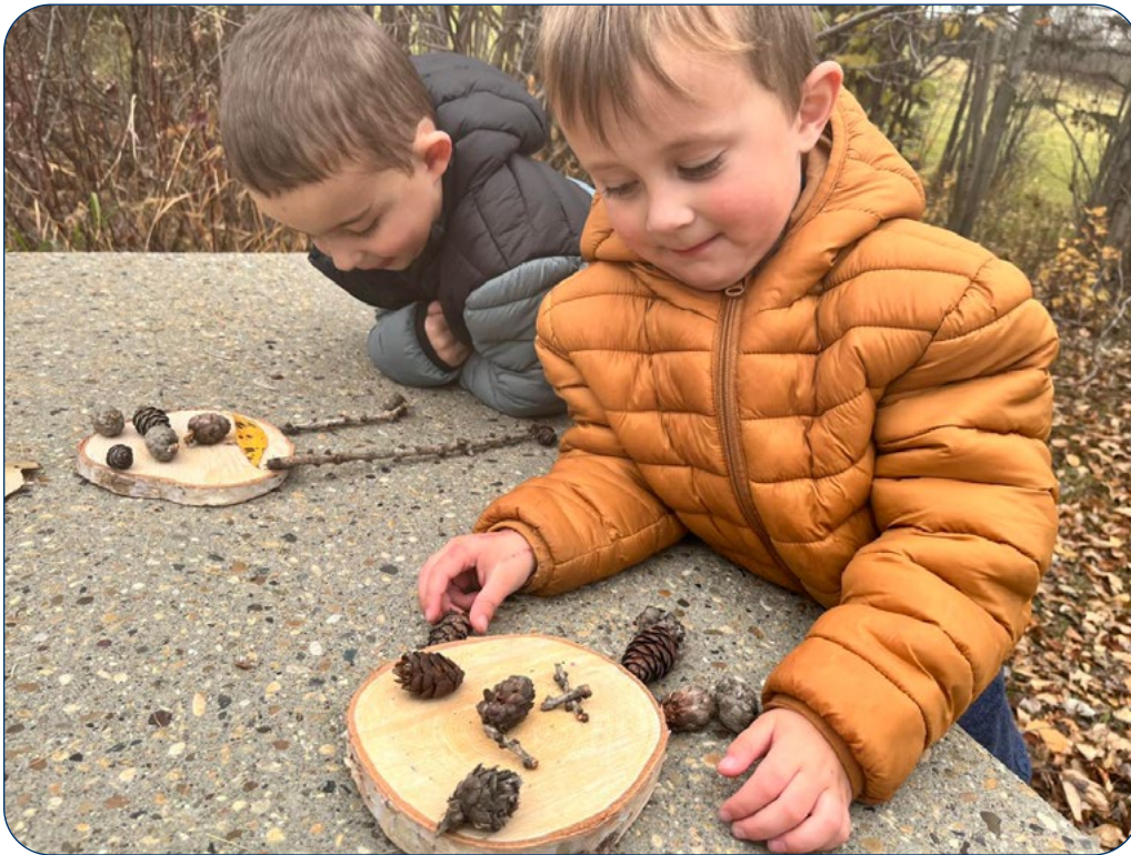
St. Luke Catholic School students create portraits using natural materials during Take Me Outside Day. See more on Page 9.