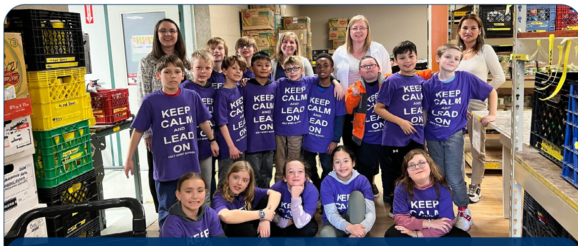
Holy Spirit Catholic School's Faith Team volunteer at the Strathcona Food Bank to pack snack bags for kids in need.