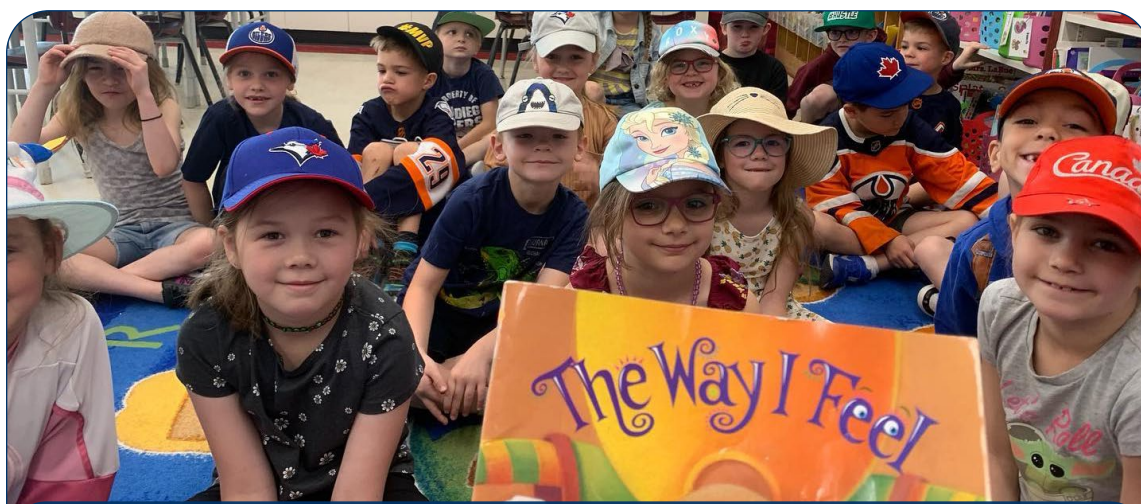
St. Nicholas Catholic School students participate in Hats on for Mental Health.