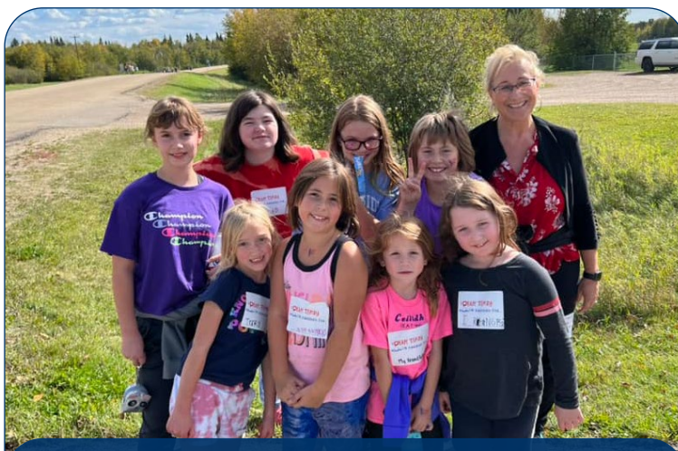
St. Luke students and staff participate in the annual Terry Fox Run in September 2023.

The review, which is conducted by EICS senior administration, found that St. Luke is a great example of what a small Catholic school should be for students, staff, and families through providing quality education in a faith-filled, welcoming, and supportive environment.