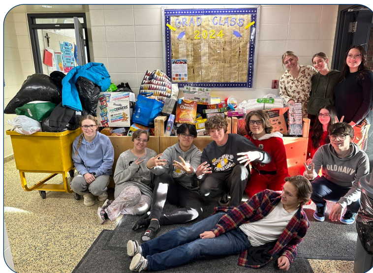
Above: St. Mary's students pose in front of goods that were collected for donation. Bottom Left: Madonna Catholic School donates to the Strathcona Food Bank. Bottom Right: St. Luke Catholic School collects donations for the Tofield Food Bank.

"Giving back to the community is crucial in fostering empathy and a sense of responsibility