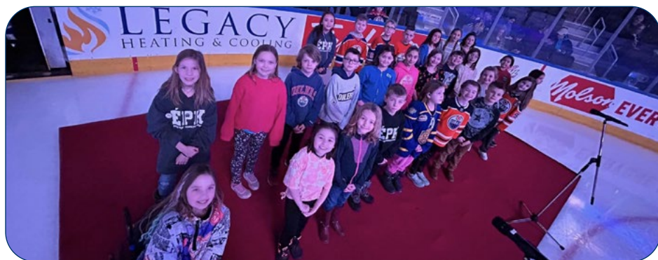
Students at École Père Kenneth Kearns Catholic School were a hit singing the national anthem for an Oil Kings home game in January.