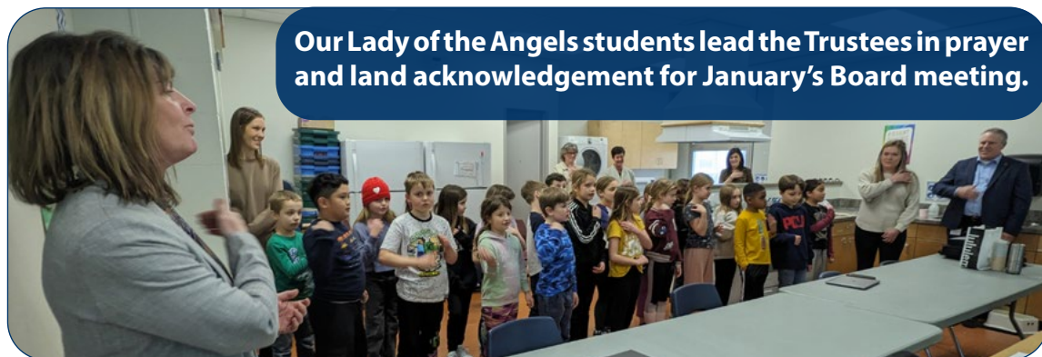
Our Lady of the Angels students lead the Trustees in prayer and land acknowledgement for January's Board meeting.

In February she further explored this calling with a focus on the importance