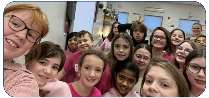
Pink Shirt Day was celebrated across our schools on Wednesday, Feb. 28.