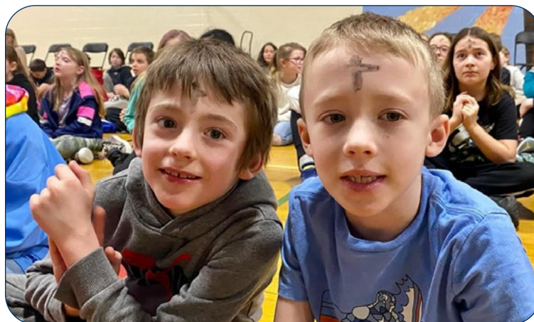
St. John XXIII students attend Mass held at their school in celebration of Ash Wednesday.

"If that declaration falls by the wayside, you're opening the door to the argument to question the existence of Catholic Education," he said.