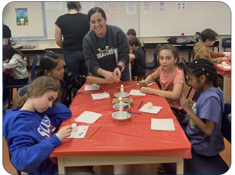
The start of the Easter season was marked across all of our schools in celebration of Christ's resurrection and the beginning of a renewed season of hope.