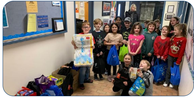
Our division and schools focused on supporting local charities during the Advent Season by way of monetary donations or by donating items. Collectively, EICS also fundraised in support of Catholic Social Services' Lurana Shelter, donating nearly $15,000 so far.