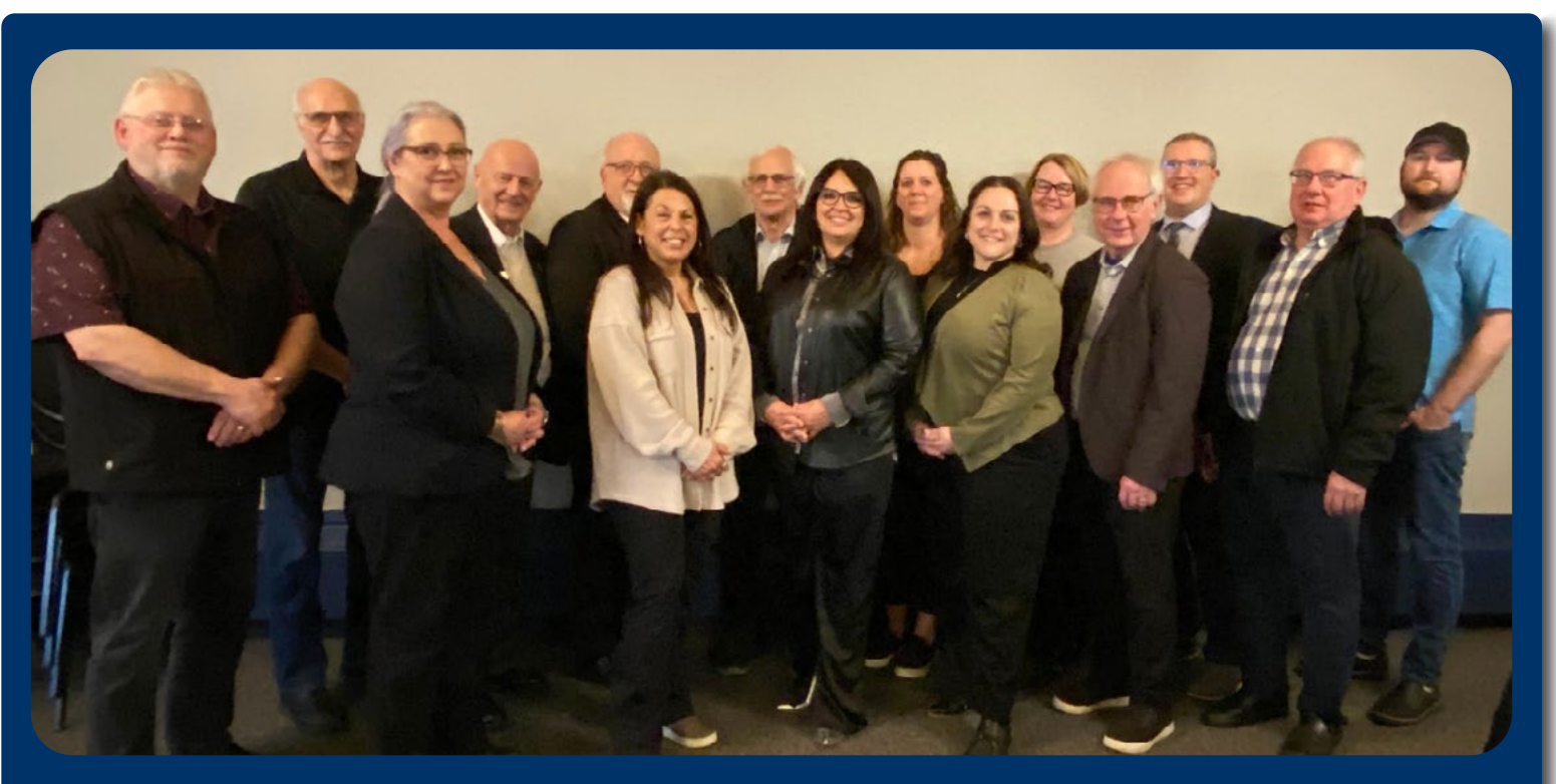
Our EICS Board of Trustees held their monthly public meeting in Vegreville on March 19, and then had the opportunity to meet with Vegreville Town Council. The group shared a meaningful conversation about how our division and the Town can work together.

The full 3-Year Capital Plan and 10-Year Facility Plan is on our website.